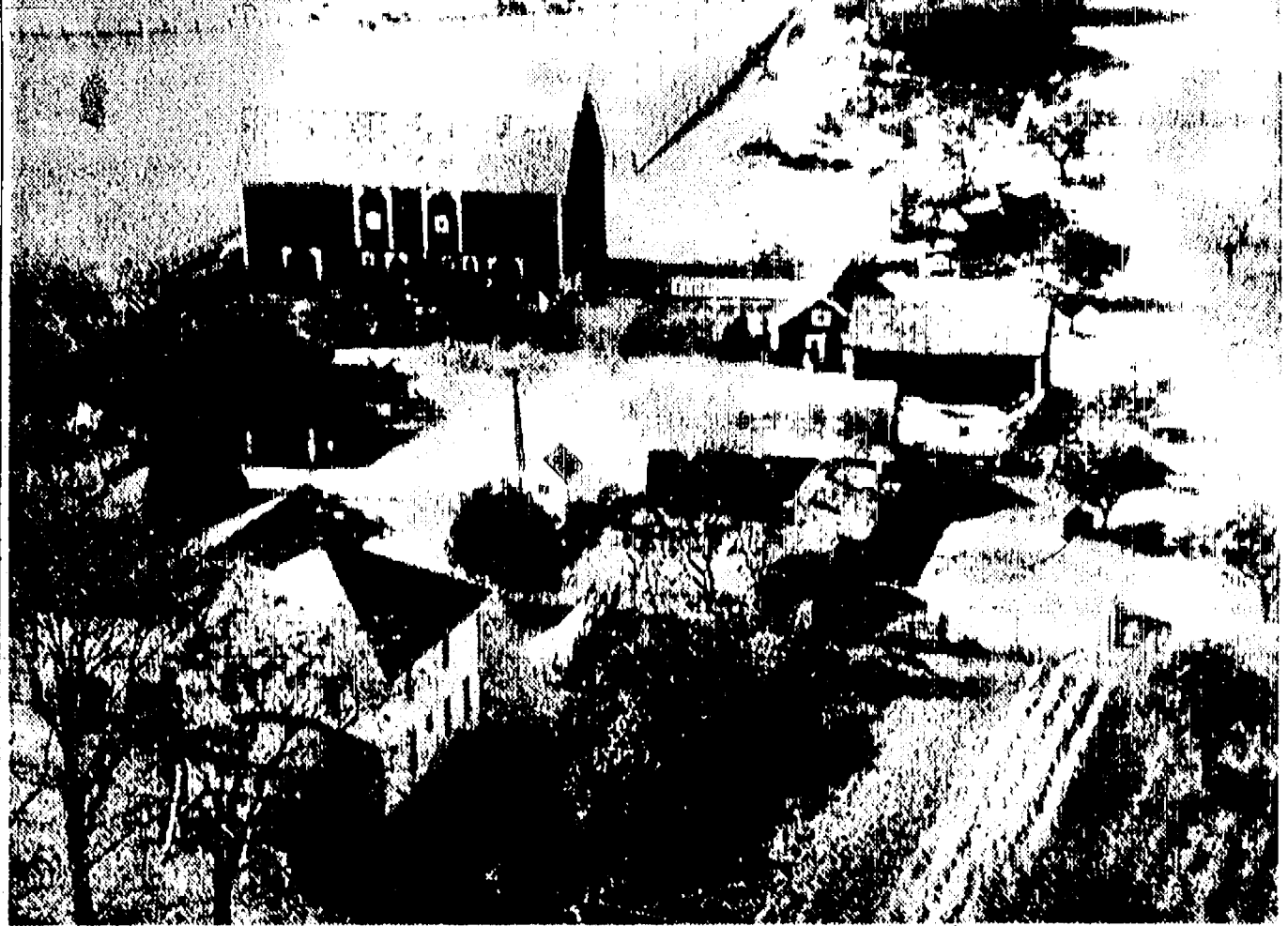
MYSTER FARM NO. 23—The many people who travel along one of the main highways of this area should experience little difficulty in identifying this week's "mystery farm" photo, although the "Federal Screw Works" sign, plainly visible at the rear of one of the buildings will probably

After the extra point, following (right)